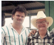
2014 Hall of Fame Inductees